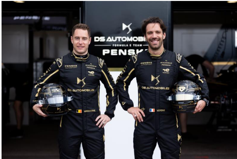
2024 Monaco E-Prix