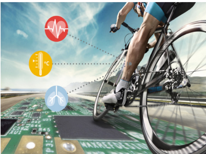
Figure 1. Wearable Health and Fitness

In addition to providing physicians with useful health information, wearable devices offer many benefits, such as player safety assessment, workout injury prevention, physical conditioning and performance metrics, and overall wellness awareness.