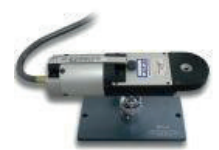
Pneumatic crimp tool for machined contacts