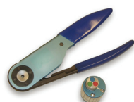
Hand tool for machined contacts