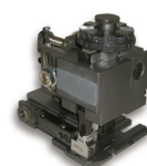
Mini applicator for stamped contacts