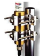
FM2 Mounting Kit (Sold separately)

Americas: +1.847.839.6925 IAS-AmericasSales@lairdtech.com