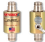
Lightning Arrestor LABH350NN (Sold Separately)