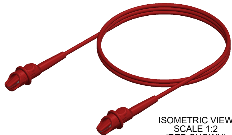
ISOMETRIC VIEW SCALE 1:2 (RED SHOWN)