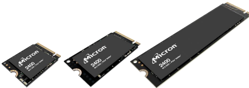
Micron 2400 SSD 22x30mm

Available in three compact M.2 form factors with capacities up to 2TB, the Micron 2400 SSD delivers improved storage density, affordability, and flexibility 2 without compromising the user experience.