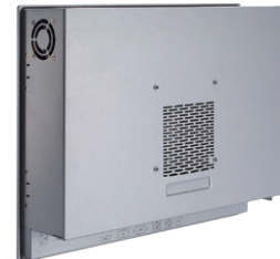
▲ Back view