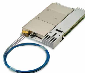
Figure 3. dualHD Low Profile