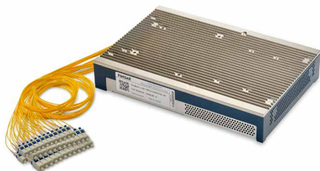
Figure 2. dualHD Standard Profile