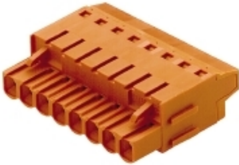
150246 BLT 5.08/ 8B SN OR