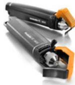
Sheathing stripper for PVC cables