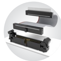
IDC cable assemblies with rugged strain relief (FFSD/FFMD, FFTP/FMTP)