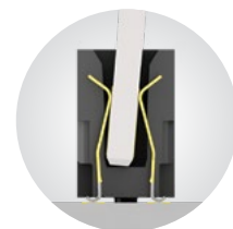
Custom designs allow for misalignment in the X-Y axes (HSEC1)