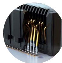
Differential pair for increased speed (HSEC8-DP)