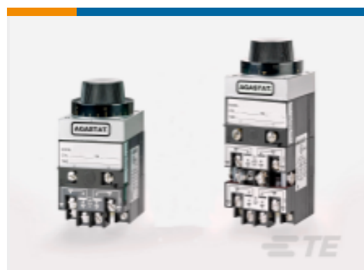
TE Part #7-1472995-0 7012WDS=RLY,STD,ON, 2P,96V,50S,S