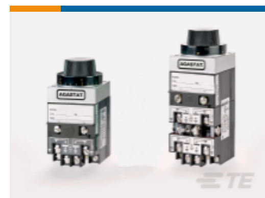
TE Part #9-1755142-1 7022NKIST=RLY,STD,OFF, 2P,48V,300S,I