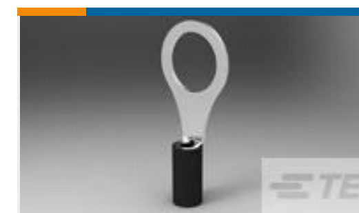
TE Part #342066 16-14 H.D.R/T 1/2" STUD BLACK