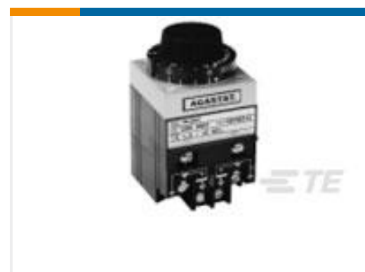
TE Part #6-1755142-4 7022WDIM=RLY,STD,OFF, 2P,96V,50S,I,M