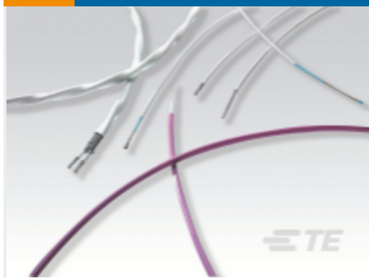
TE Part #ES3304-000 SPEC 80 Hookup Wire: FlexLine Cable, Nickel Coated Copper