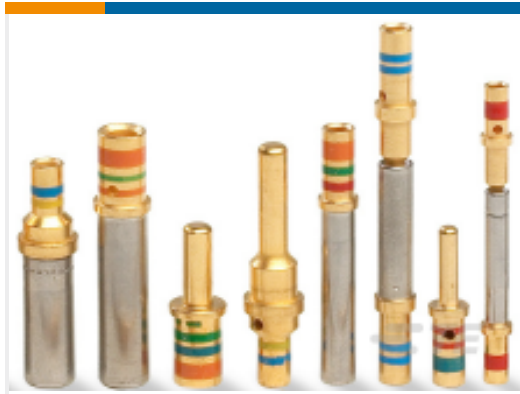
TE Part #12331-22 CONT PIN (182-0441-22)