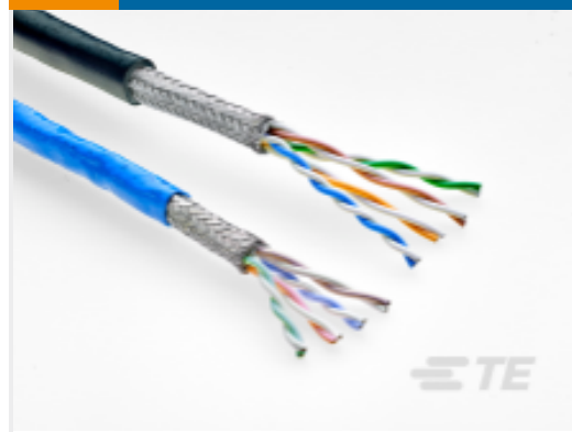
TE Part #EP7191-000 C5E-26C444XU9A