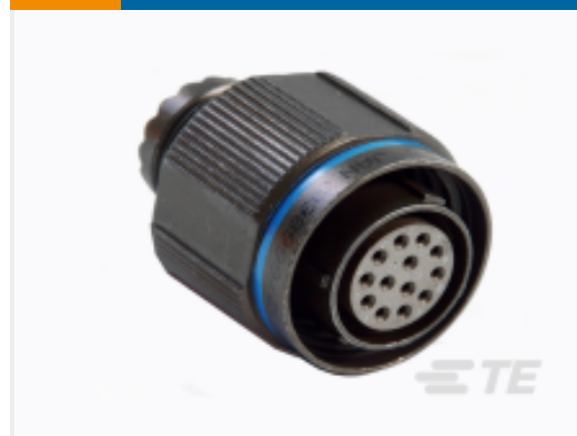
TE Part #YDTS26T25-19PAV001 PLUG ASSY