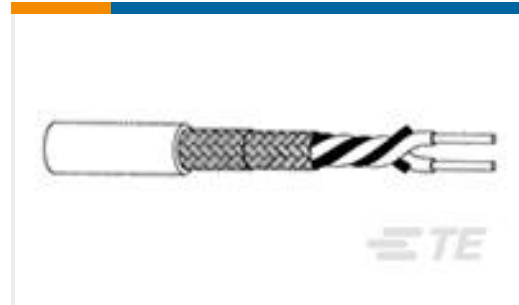
TE Part #084319-000 7724G3664-9