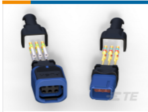
TE Part #YD369-R33-AP0-113L 369 3 WAY REC,NO CONTACTS, OUTGASSED,PIN