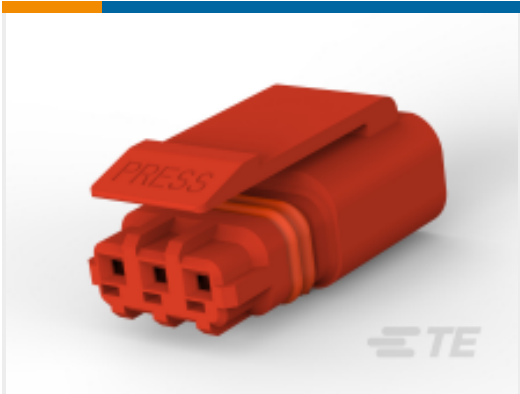
TE Part #3-2834074-3 3P PLUG, MINIATURE WATERPROOF CONN,RED