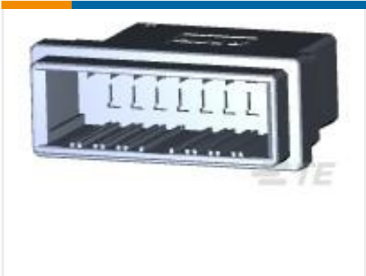
TE Part #178964-7 DYNAMIC D-3 W-T-W TAB HSG 16P