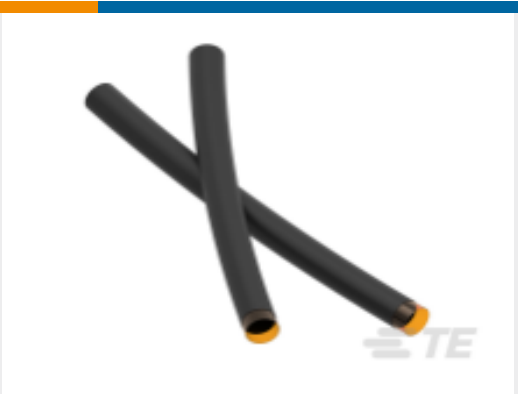
TE Part #CX7199-000 RHW Heat Shrink Tubing