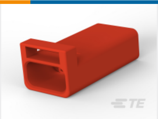
TE Part #3-2834075-3 3P REC, MINIATURE WATERPROOF CONN,RED