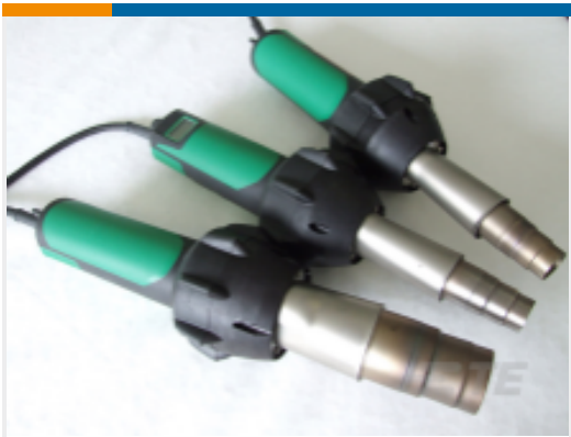
TE Part # EG1114-000 CV1981-ST-230V1600W-EU

numbers that TE has identified as EU ELV compliant have a maximum concentration of 0.1% by weight in homogenous materials for lead, hexavalent chromium, and mercury, and 0.01% for cadmium, or qualify for an exemption to these limits as defined in the Annexes of Directive 2000/53/EC (ELV). Regarding the REACH Regulation, the information TE provides on SVHC in articles for this part number is based on the latest European Chemicals Agency (ECHA) 'Guidance on requirements for substances in articles' posted at this URL: https://echa.europa.eu/guidance-documents/guidance-on-reach