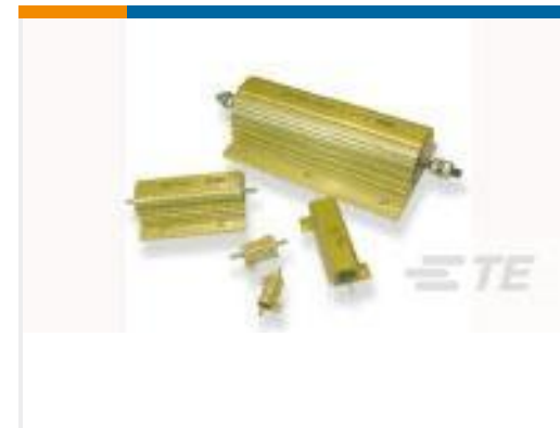
TE Part #1625980-6 HSX25 R22 5%