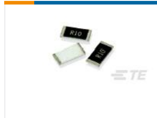
TE Part #2176050-3 RLP73M 1E R062 5% 5K RL