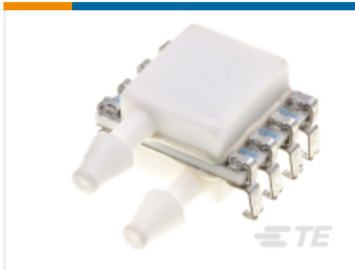
TE Part #4515-DS3A030DP 30IN DP PRESSURE SENSOR 10% TO 90%