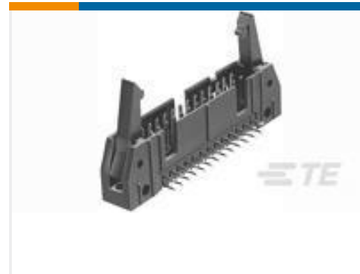
TE Part #1-499786-2 064 UNIV HDR RA 4S 15DP STD L1