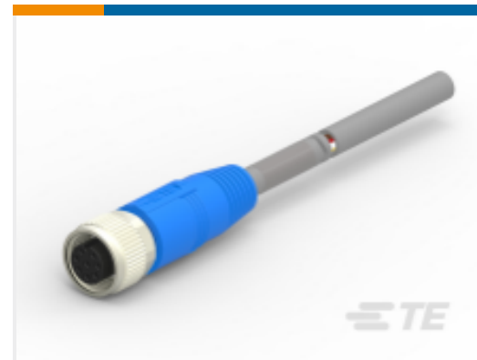
TE Part #T4161320008-003 RPC-M12-FS-8CON-PUR-1.5SH