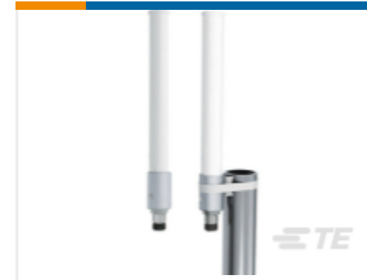
TE Part #OC69271-FNF OMNI,DBAND,FIXED,NF 698-960MHz, 1.5dBi