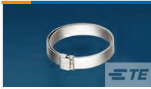
TE Part #CW2824-000 R85049/128-7