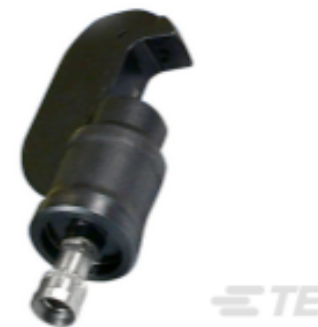
TE Part # 69099 HYP8 12-350MCM 18T HEAD