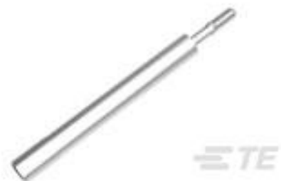
TE Part #747784-8 JACKSCREW KIT,4-40, BULK