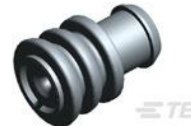
TE Part #828904-1 SINGLE WIRE SEAL FOR J.P.T.CON