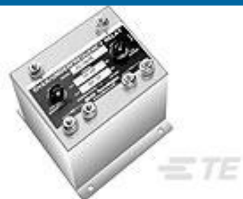
TE Part #2-1618071-0 25-060-22X=WILMAR O/U Frequency