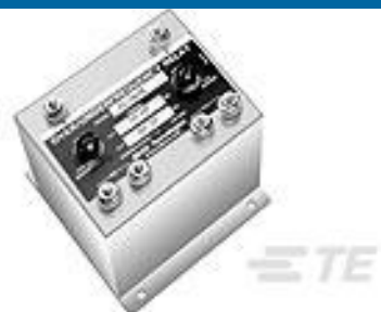
TE Part #2-1618071-6 25-060X=WILMAR OVER/UNDER FREQ