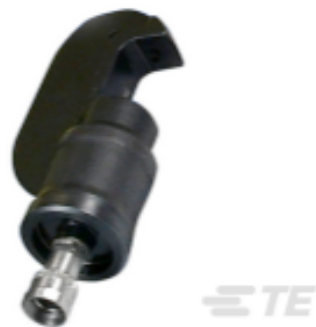
TE Part # 1752868-1 HYP10 12-350MCM 18T HEAD