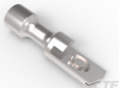
TE Part # CAT-AM74-AM74K AMPOWER Knife Disconnect