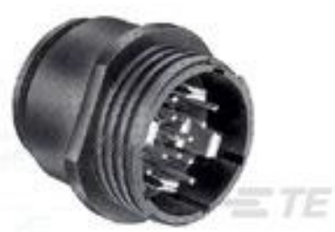
TE Part #211825-2 CPC RECPT ASSEMBLY SIZE 23-13