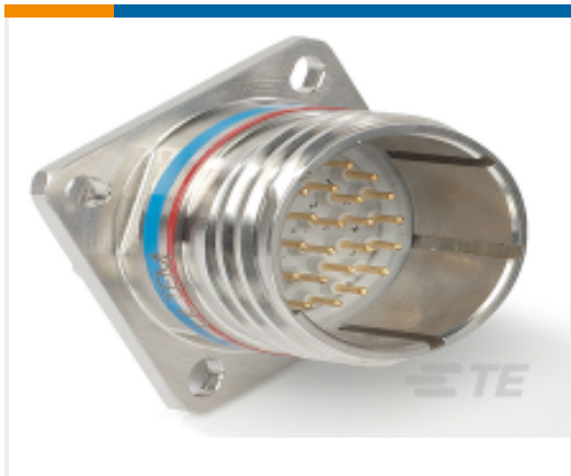
TE Part #YDTS20F21-41SBV001 RECP ASSY