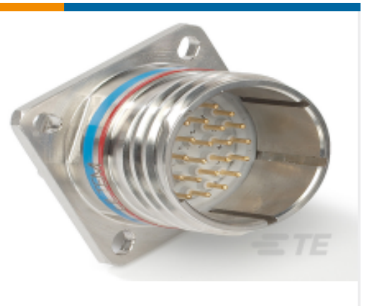
TE Part #YDTS20W25-43SCV001 RECP ASSY