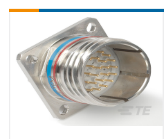
TE Part #YDTS20F21-41SBV001 RECP ASSY