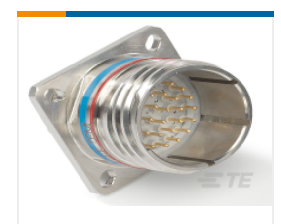
TE Part #YDTS20F21-41SBV001 RECP ASSY