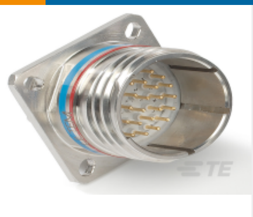
TE Part #YDTS20W25-43SCV001 RECP ASSY