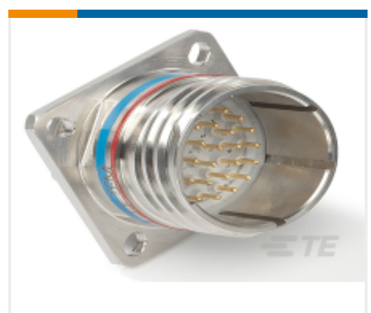
TE Part #YDTS20F21-41SBV001 RECP ASSY