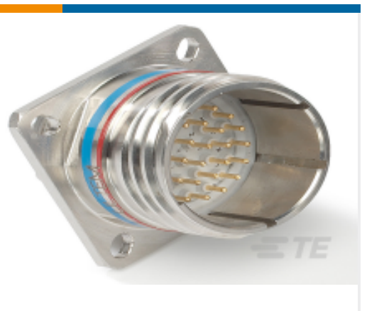
TE Part #YDTS20W25-43SCV001 RECP ASSY