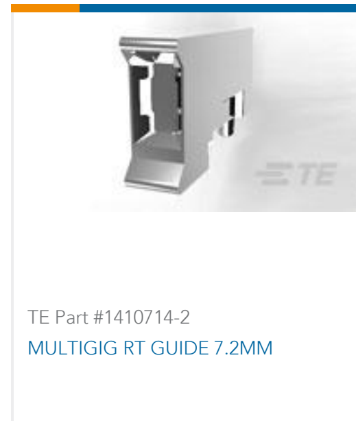
TE Part #1410714-2 MULTIGIG RT GUIDE 7.2MM