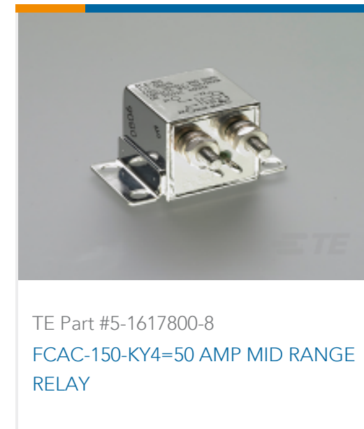
TE Part #5-1617800-8 FCAC-150-KY4=50 AMP MID RANGE RELAY