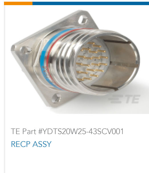
TE Part #YDTS20W25-43SCV001 RECP ASSY