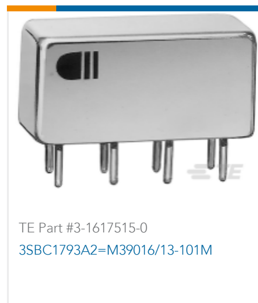
TE Part #3-1617515-0 3SBC1793A2=M39016/13-101M