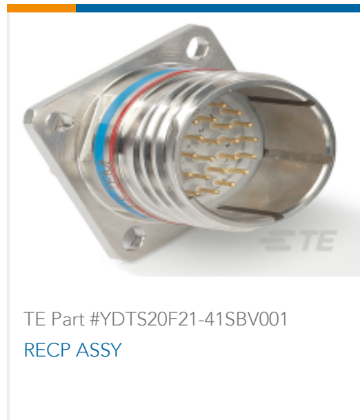
TE Part #YDTS20F21-41SBV001 RECP ASSY