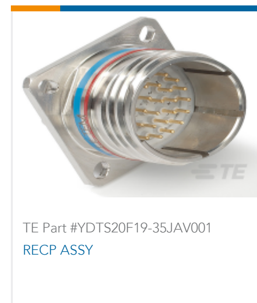
TE Part #YDTS20F19-35JAV001 RECP ASSY