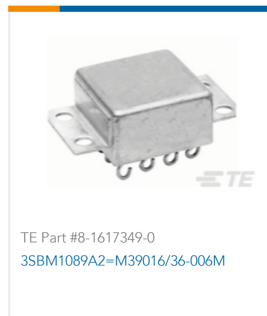
TE Part #8-1617349-0 3SBM1089A2=M39016/36-006M