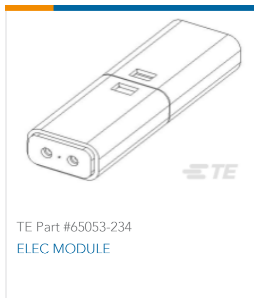
TE Part #65053-234 ELEC MODULE