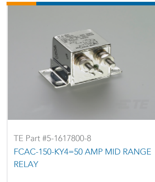
TE Part #5-1617800-8 FCAC-150-KY4=50 AMP MID RANGE RELAY