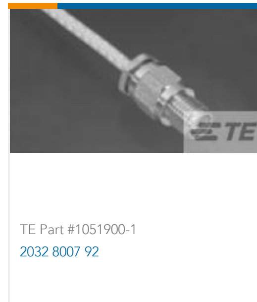
TE Part #1051900-1 2032 8007 92