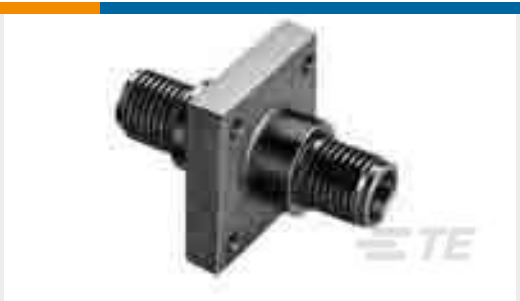
TE Part #449690-1 LGH-1 BULKHEAD RECEPT.