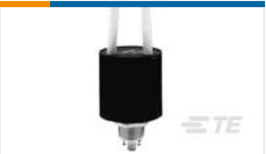
TE Part #1618276-9 K61A741=RELAY, PRESSURIZED