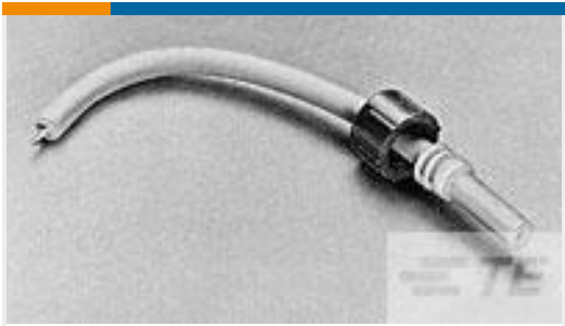
TE Part #1-863701-3 LGH-1 LEAD MLD END