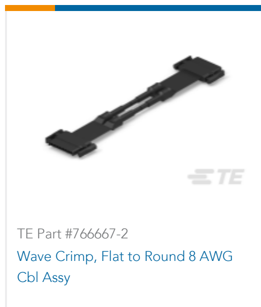
TE Part #766667-2 Wave Crimp, Flat to Round 8 AWG Cbl Assy