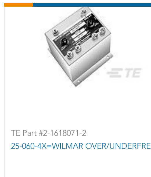
TE Part #2-1618071-2 25-060-4X=WILMAR OVER/UNDERFRE