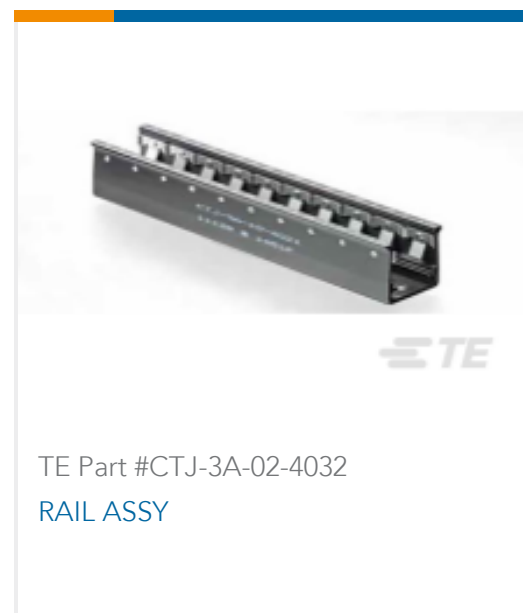
TE Part #CTJ-3A-02-4032 RAIL ASSY