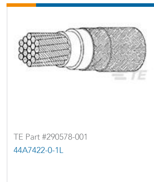
TE Part #290578-001 44A7422-0-1L