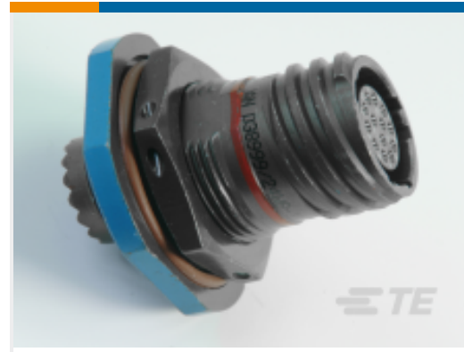
TE Part #YDTS24F25-24SNC001 RECP ASSY