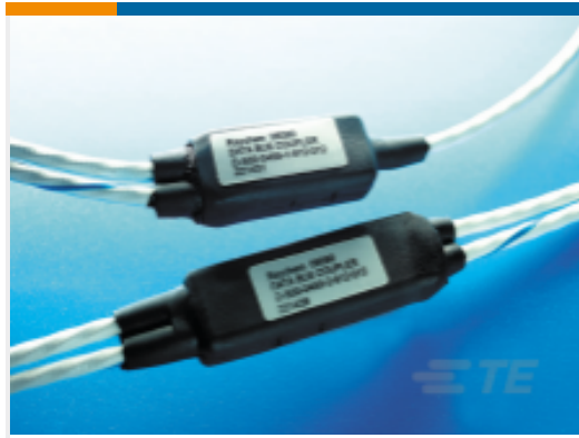
TE Part #CC4099-000 D-500-0466-2-612-120