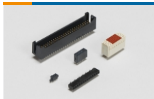
Board-to-Board Headers & Receptacles(7581)