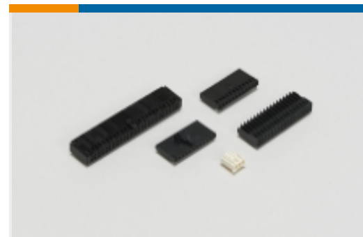
Wire-to-Board Connector Assemblies & Housings(65)