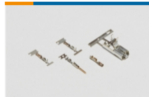
Wire-to-Board Connector Contacts(26)