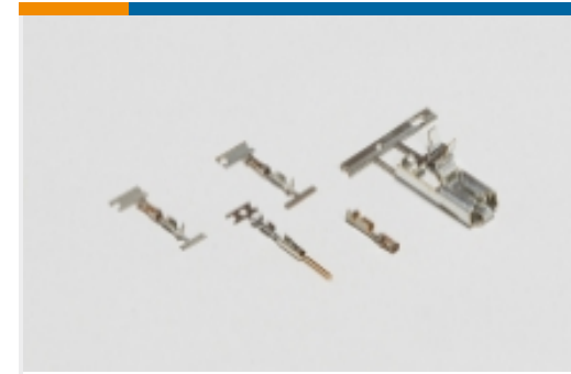
Wire-to-Board Connector Contacts(26)