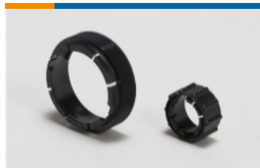
Circular Connector Adapters(2)