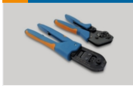
Portable Crimp Tools(33)