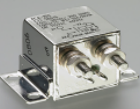
TE Model / Part #5-1617800-8 FCAC-150-KY4=50 AMP MID RANGE RELAY