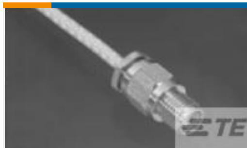
TE Model / Part #1051900-1 2032 8007 92