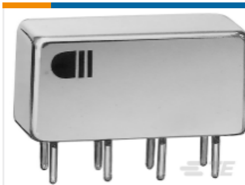
TE Model / Part #3-1617515-0 3SBC1793A2=M39016/13-101M