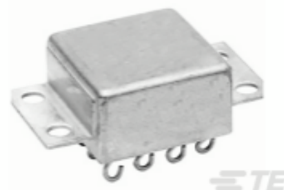
TE Model / Part #8-1617349-0 3SBM1089A2=M39016/36-006M