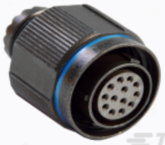
TE Model / Part #YDTS26F19- 35HAV001 PLUG ASSY