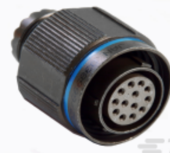
TE Model / Part #YDTS26F19- 35HBV001 PLUG ASSY