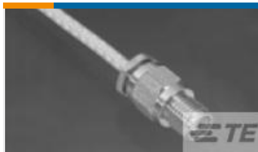
TE Model / Part # 1051900-1 2032 8007 92