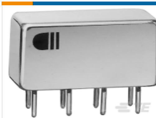
TE Model / Part # 3-1617515-0 3SBC1793A2=M39016/13-101M