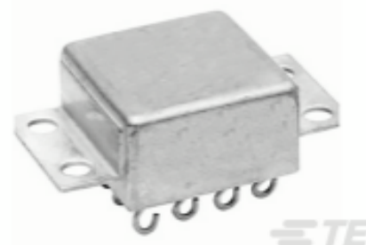
TE Model / Part # 65053-234 ELEC MODULE