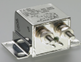
TE Model / Part # 5-1617800-8 FCAC-150-KY4=50 AMP MID RANGE RELAY