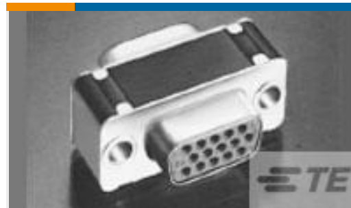
TE Part #211013-4 CONN SAVER,62 POSN, AMPLIMITE