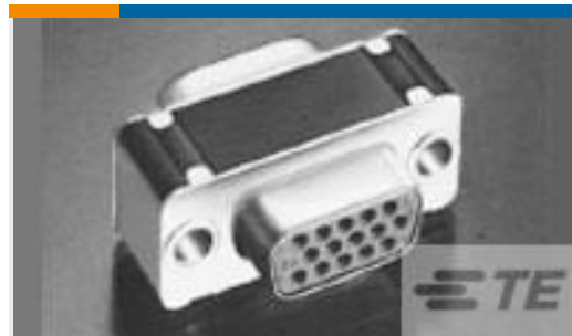
TE Part #211012-4 AMPLIMITE CONN SVR,44 POS,TRW