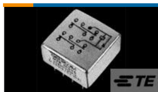
TE Part #1617086-6 3SBM1071A2 = M39016 /31-003M