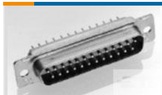
TE Part #206066-2 PLUG ASSY,104 POSN, AMPLIMITE