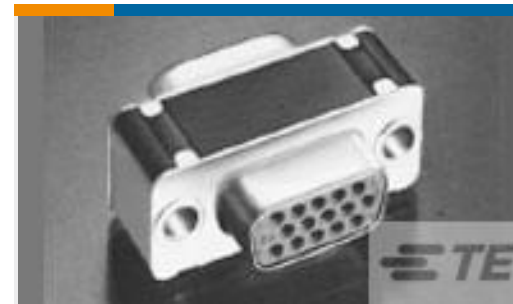
TE Part #212562-2 AMPLIMITE CONN SVR,37 POS,TRW