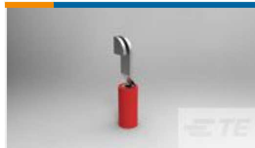
TE Part #696451-1 PIDG 22-16 K-D,NI-PL