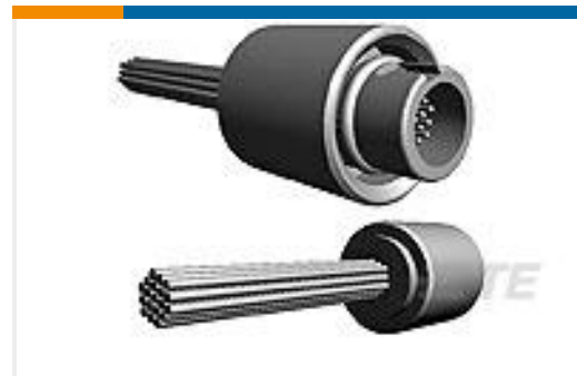
TE Part #1589064-4 TCM019PC2DC006 = CIRCULAR