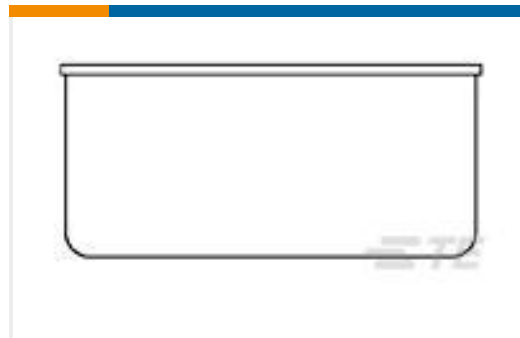
TE Part #205282-1 DUST CAP FOR PLUG