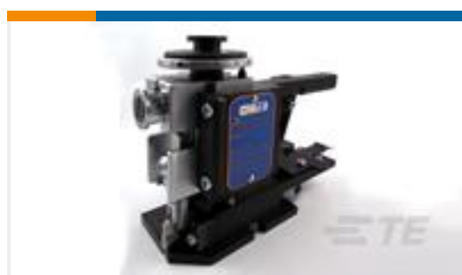
TE Part #2150236-1 OCEAN_2.0_APPLICATOR-E-062F090F