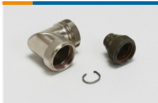
Screened Backshells & Adapters(1)