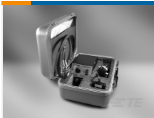
TE Part # 173643-000 RH-3960-1-TINEL-KIT-120V