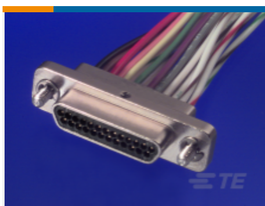
TE Part #1-1532185-0 M83513/03-G14N, MCKS-N1-B-51P6G9-72.0