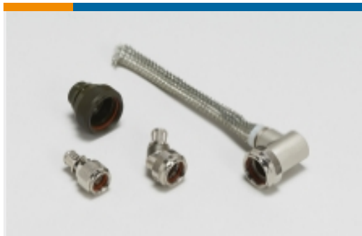
Ruggedized Backshells & Adapters (2821)