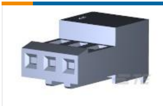
TE Part #3-641193-3 03P MTA100 CONN ASSY GRN LF