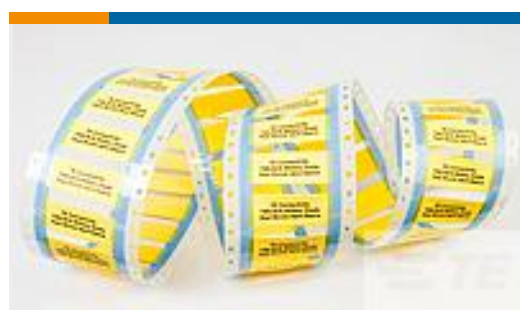
TE Part #2544650001 TMS-SCE-1K-3/16-2.0-6