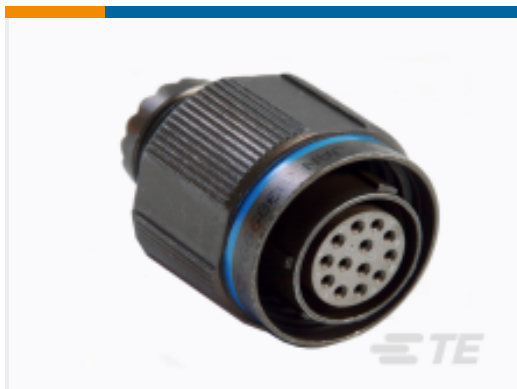
TE Part #YDTS26Z11-35SBV001 PLUG ASSY