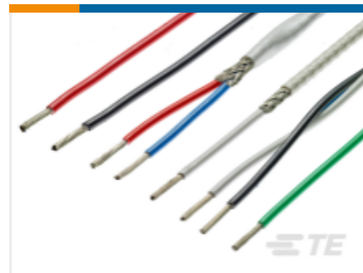
TE Part #3741883001 44A0121-14-0/2