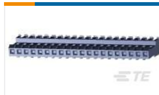
TE Part #5-640599-0 20P MTA156 CONN ASSY 18AWG ORA