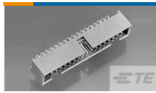
TE Part #1761682-6 IDC LOW PRO HDR 16P RA HT BLACK