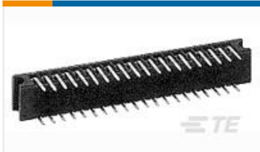
TE Part #6-532956-0 70 MODII 2PC CE RCPT ASSY, RoHS