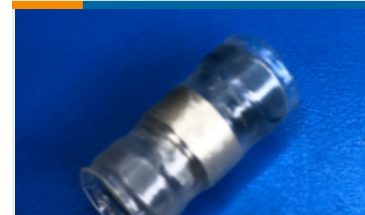
TE Part #621760-000 D-142-51CS2828