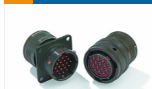
TE Part #ZPF000000000006623 951-06 R 18-800 S 50