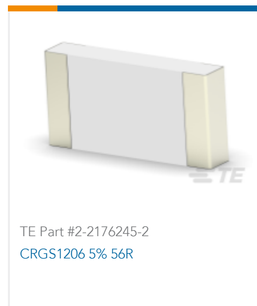
TE Part #2-2176245-2 CRGS1206 5% 56R