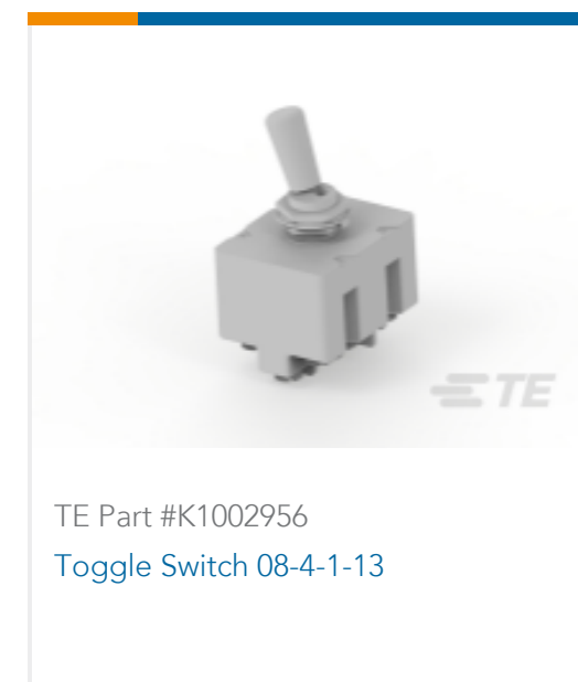
TE Part #K1002956 Toggle Switch 08-4-1-13