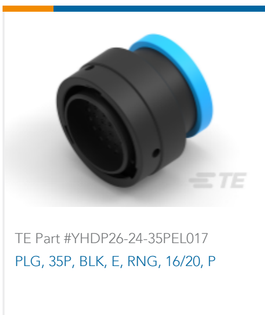
TE Part #YHDP26-24-35PEL017 PLG, 35P, BLK, E, RNG, 16/20, P