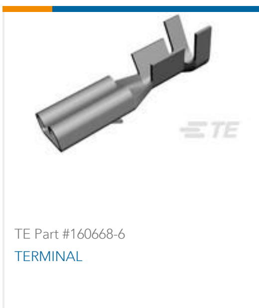
TE Part #160668-6 TERMINAL