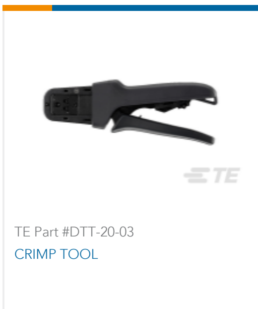
TE Part #DTT-20-03 CRIMP TOOL