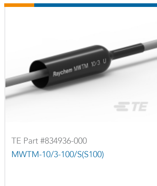
TE Part #834936-000 MWTM-10/3-100/S(S100)