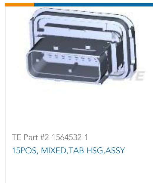
TE Part #2-1564532-1 15POS, MIXED, TAB HSG, ASSY