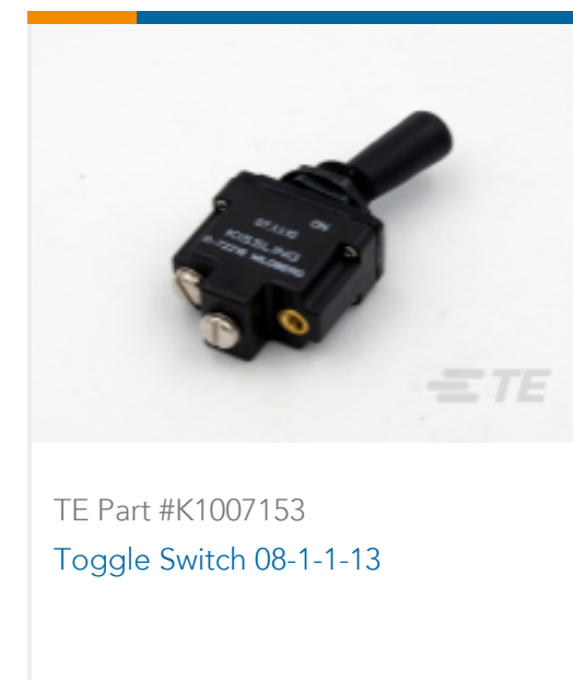
TE Part #K1007153 Toggle Switch 08-1-1-13