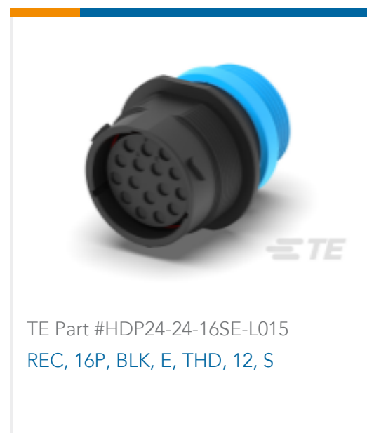
TE Part #HDP24-24-16SE-L015 REC, 16P, BLK, E, THD, 12, S