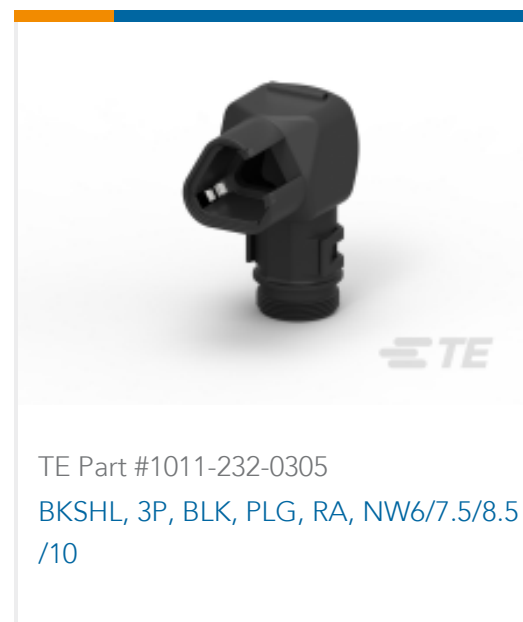
TE Part #1011-232-0305 BKSHL, 3P, BLK, PLG, RA, NW6/7.5/8.5 /10