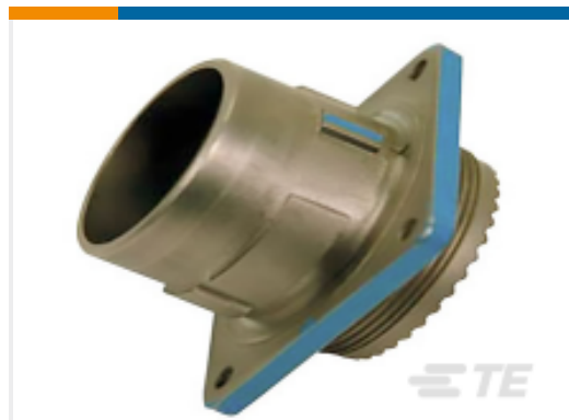
TE Part #YDIV43E23-55SNC003 RECP ASSY