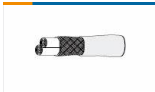
TE Part #316203-000 55A1131-20-2/6/9-9