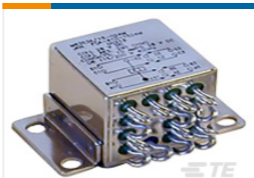
TE Part #1617756-3 FCA-410-CY2