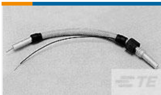
TE Part #862545-8 LEAD, SGL END ASSY, LGH