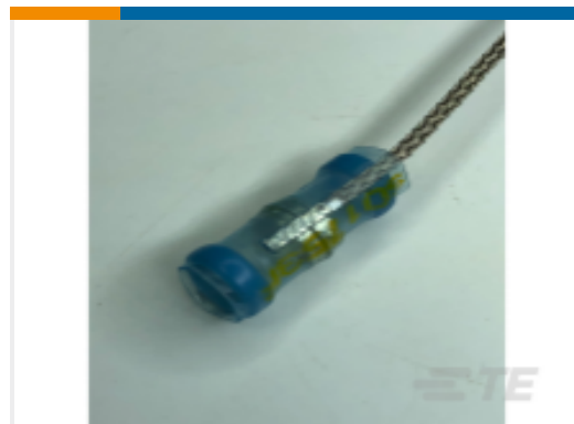
TE Part #209036-001 SO63-4-W1-24-9-100CS2870