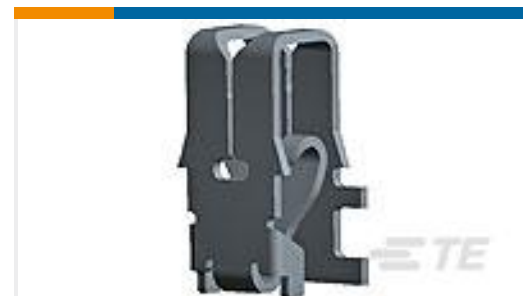
TE Part #964339-1 MAG MATE KONT. MKII