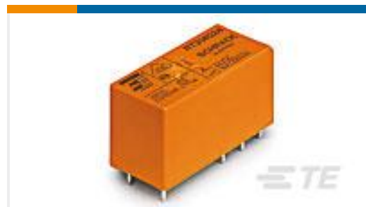
TE Part #2-1393243-4 RTE25524