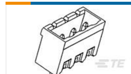
TE Part #1-1546111-0 EUROSTYLE TB,HEADER,GREY,10POS