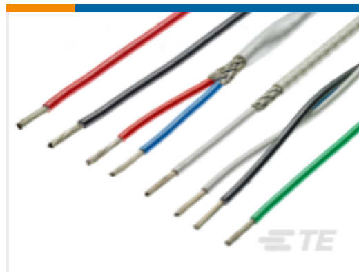
TE Part #262172-001 81044/6-14-2