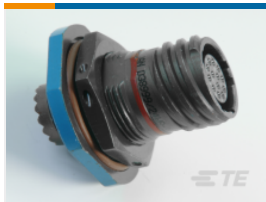
TE Part #YDTS24F11-99PAV001 RECP ASSY