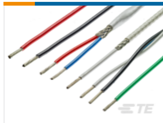
TE Part #262087-001 81044/6-2-9