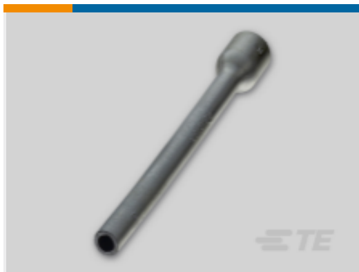
TE Part #138518-000 202F274-51-10/164-0