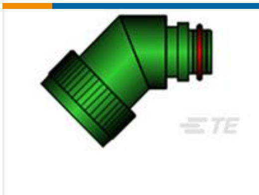
TE Part #EG1602-000 TX15AZ45-0804