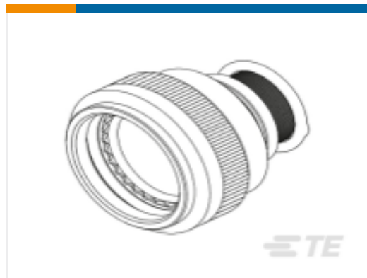
TE Part #CZ6612-000 TX40AZ00-1004