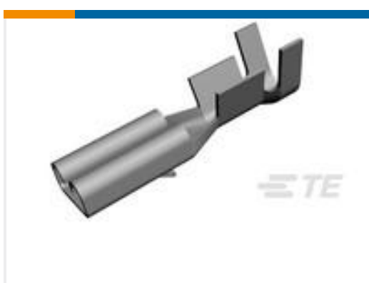
TE Part #160668-6 TERMINAL