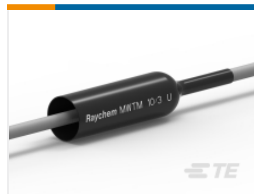
TE Part #834936-000 MWTM-10/3-100/S(S100)