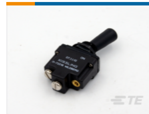
TE Part #K1007153 Toggle Switch 08-1-1-13