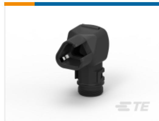
TE Part #1011-232-0305 BKSHL, 3P, BLK, PLG, RA, NW6/7.5/8.5 /10