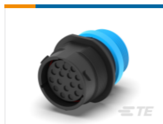
TE Part #HDP24-24-16SE-L015 REC, 16P, BLK, E, THD, 12, S