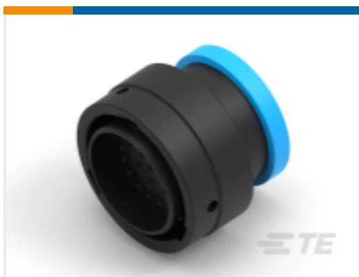
TE Part #YHDP26-24-35PEL017 PLG, 35P, BLK, E, RNG, 16/20, P