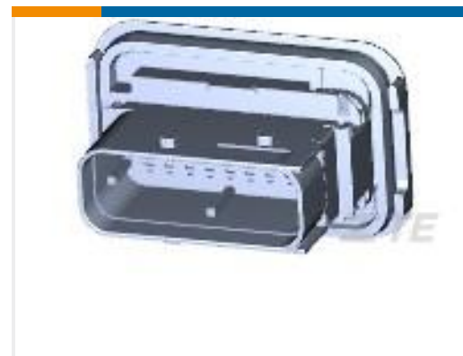
TE Part #2-1564532-1 15POS, MIXED,TAB HSG,ASSY