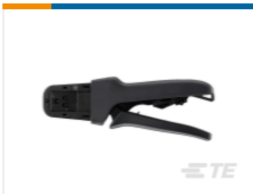
TE Part #DTT-20-03 CRIMP TOOL