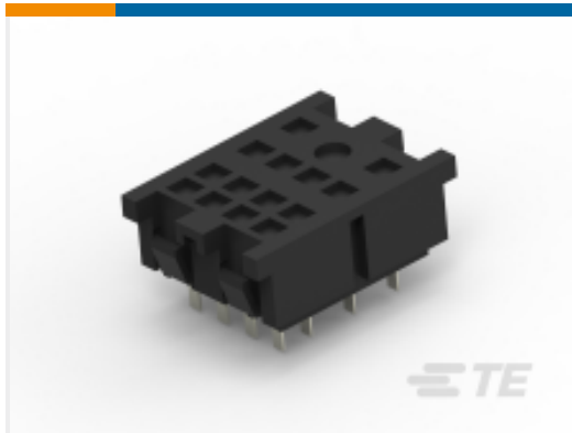
TE Part #1419106-2 27E007=SOCKET,KH,14,PC,PHEN,BL