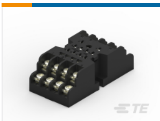
TE Part #1-1393143-9 27E166=SOCKET,KH,14,SCW,PLES