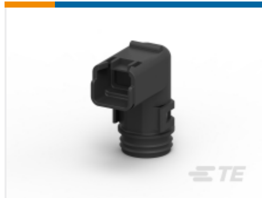
TE Part #1011-256-0205 BKSHL, 2P, BLK, PLG,RA,SR,NW6/7.5 /8.5/10