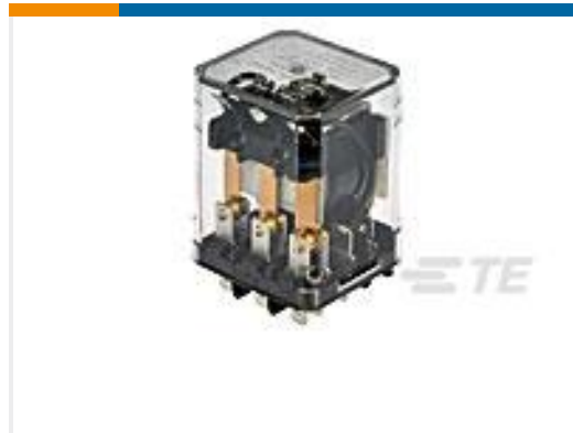
TE Part #1-1393118-4 KUP-14D15-24=KU-