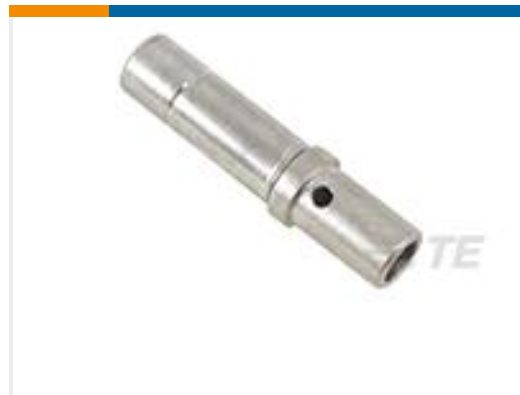
TE Part #0462-203-12141 SOC, SOLID, SIZE 12, 12-14AWG, NI