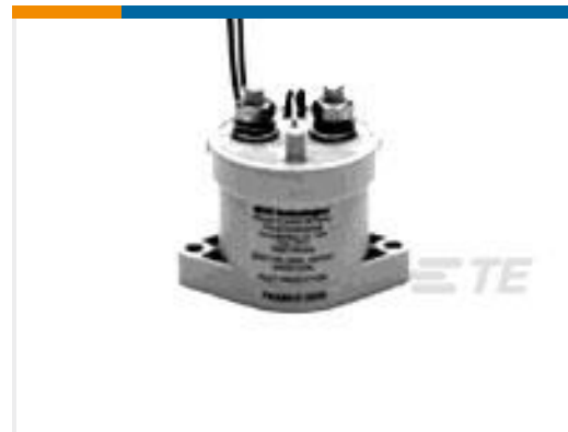
TE Part #1618002-7 EV200AAANA=RELAY, EV200 SPST-N