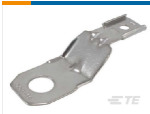
TE Part #1027-003-1200 CLIP, SS, 11MM HOLE, ST