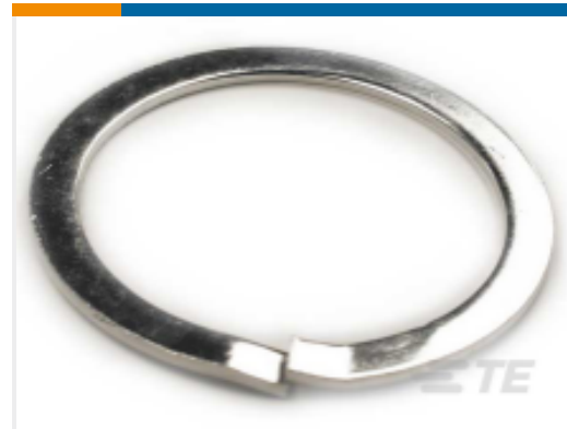
TE Part #112264-ZZ LOCKWASHER, SIZE 24, HD30