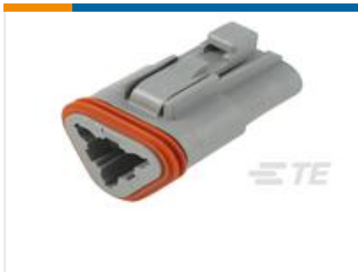
TE Part #DT06-3S PLG, 3P, GRY, N