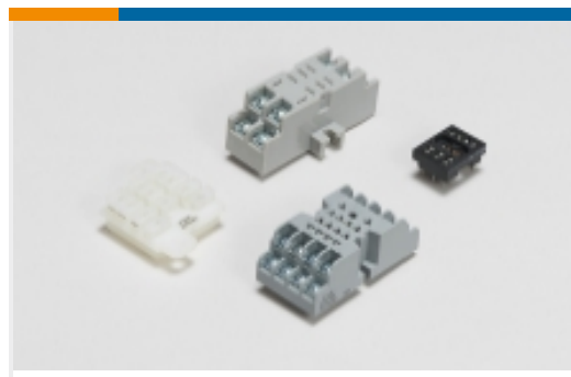
Relay Accessories, Sockets & Clips(7)