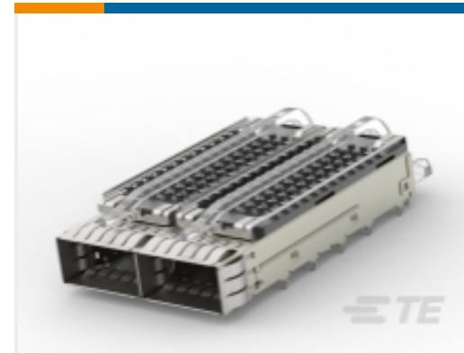
TE Part #2170808-1 QSFP28, 1X2, CAGE ASSY, SPRING, HS, LP