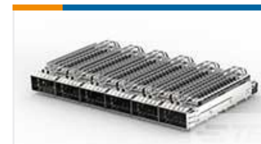
TE Part #2-2170708-1 CAGE ASSY, 1X6, QSFP28, SPRING, HS, LP