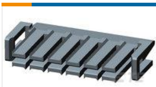
TE Part #2-1969541-8 RETAINER, TPA, DUAL ROW, EP2.5