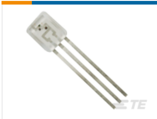
TE Part #11032254-00 EMITTER 660/940NM 1 2