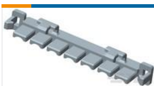
TE Part #1-1969609-1 11P VAL-U-LOK TPA 26-22 AWG