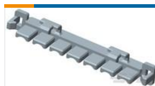
TE Part #1-1969609-2 12P VAL-U-LOK TPA 26-22 AWG