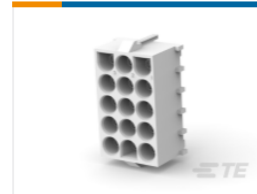
TE Part #2213756-4 3 ROW 15P HIGH TEMP UMNL SKT ASSM