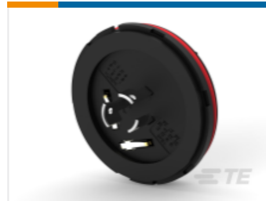
TE Part #1-2336396-1 ASSEMBLY, LIGHT CONTROLLER BASE, W/VENT