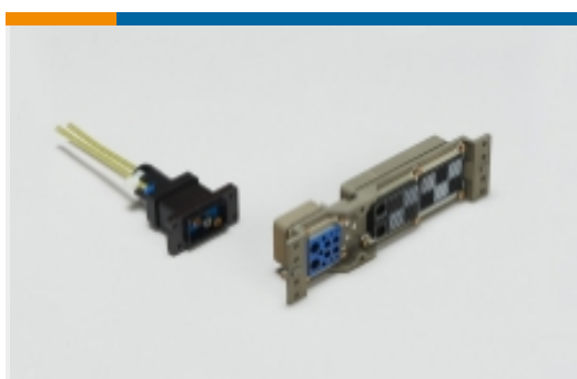
Rack & Panel Connectors(28)