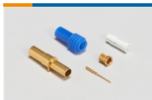
Rack & Panel Contacts(1)