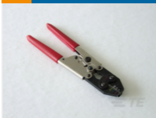
TE Part # 992008-000 AD-1377-CRIMP-TOOL-3-CVTY