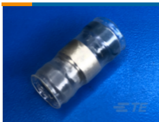
TE Part #478341-000 D-142-65-202-7776