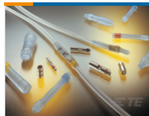
TE Part #847830-000 D-101-31CS2825