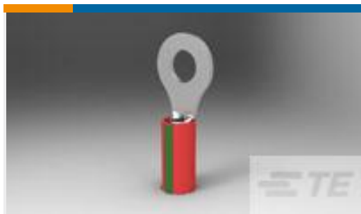
TE Part #132250-1 TERMINAL RING TONGUE PIDG 22 AWG