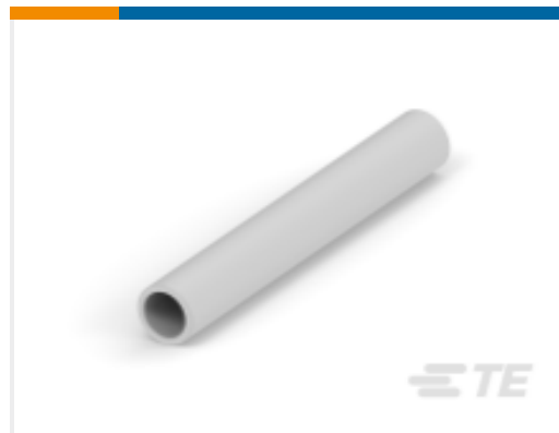
TE Part #5053514004 RNF-3000 Single Wall Stick Heat Shrink