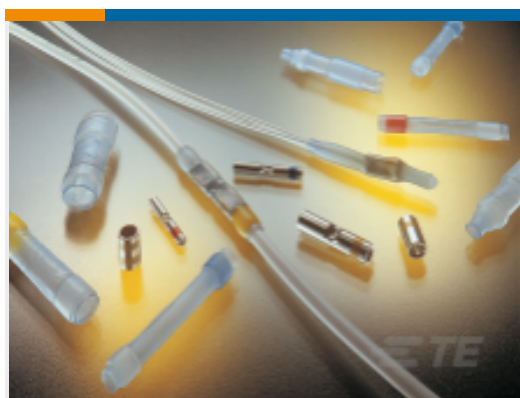
TE Part #798548-000 D-107-31CS2825