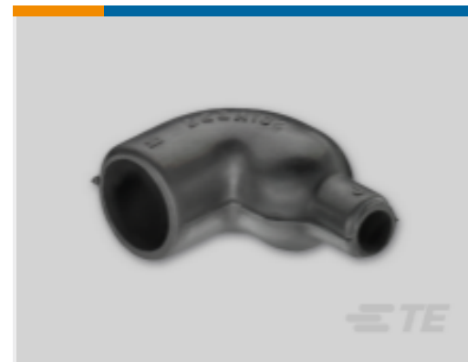
TE Part #807767-000 Bulbous Heat Shrink Boots: Lipped, Right Angle