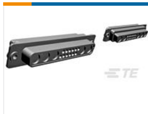
TE Part #445726-1 RECEPT ASSY,21C4,AMPLIMITE