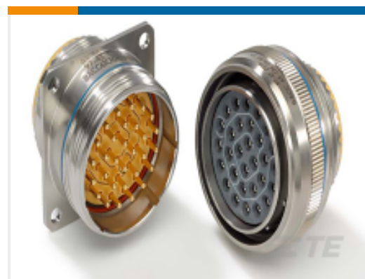
TE Part #ZPF000000000008685 983-6S 22-55 S6