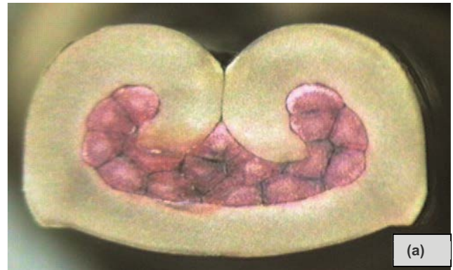
Cross Sections Showing Minimum (a) and Maximum (b) Area Index per Terminal Specification—a Variation of \pm 3.5\%

Therefore, varying the CW by 2% would result in a CH variation of 2%, or 0.0014 in. At a CH tolerance of \pm 0.002 in, 35% of the total CH tolerance would be used by a 2% variation in CW. Thus, the importance of crimp width control is obvious when tooling is changed during a production run.