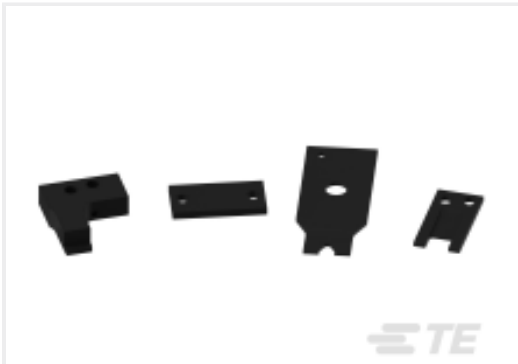
TE Part #3-459722-0 BLADE, SLUG