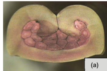
Significant flash can be generated with excessive anvil to crimper clearance, as shown by nominal design condition (a) and +0.003 in over nominal

Dimensional control is clearly critical.