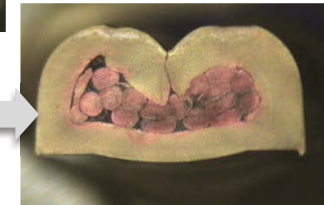
Visible deformation of outer crimp surface because of indentation from material buildup on crimper.

Chromium plating has the ability to be applied uniformly and consistently and exhibits excellent adhesion to the base metals. The unique benefits of chromium plating, such as ease of application, consistency of plating, adhesion to base metal, extremely low coefficient of friction, very high hardness, and resistance to adhesion, make it truly difficult to match in crimp performance and durability. However many alternative coatings are being attempted, and some show excellent promise in specific applications.