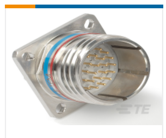
TE Part # CAT-D38999-DTS3P D38999: Square Flange, 19-35 insert