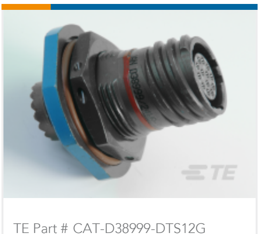
TE Part # CAT-D38999-DTS120 D38999: Jam Nut, 19-35 Insert